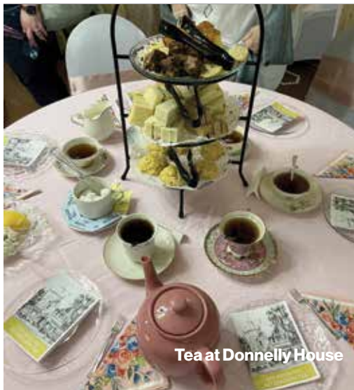
Tea at Donnelly House