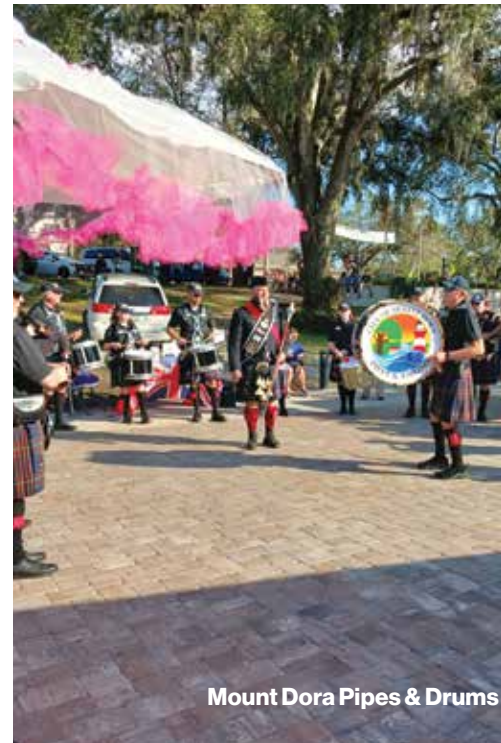
Mount Dora Pipes & Drums