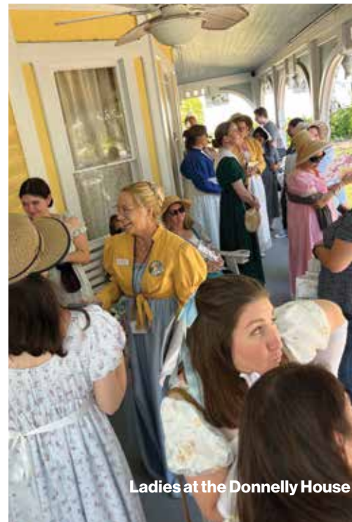
Ladies at the Donnelly House