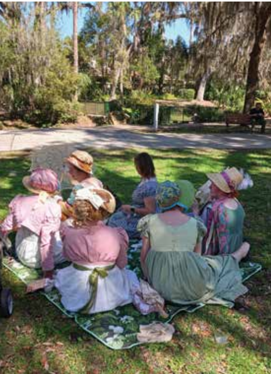
Enjoying a leisurely picnic with friends