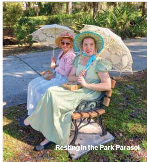
Resting in the Park Parasol