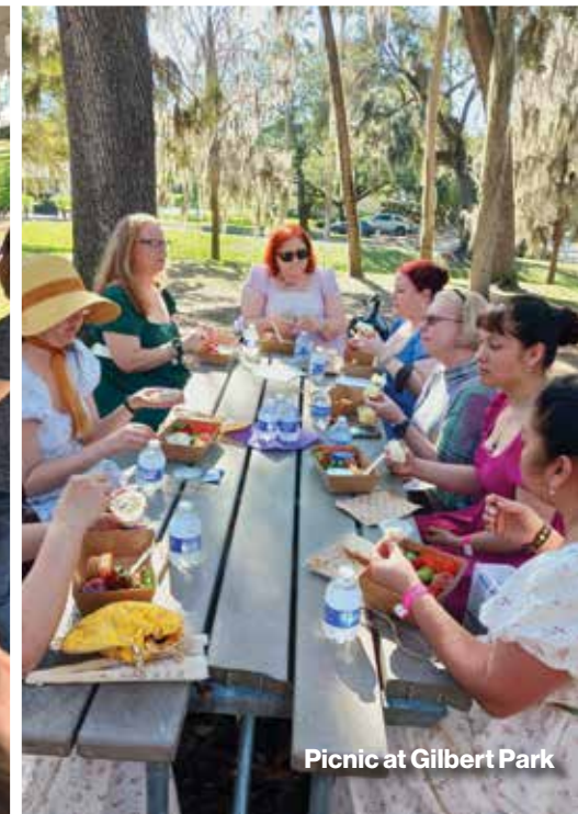
Picnic at Gilbert Park